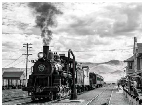
04 - All Aboard!.jpg

Interesting subject matter. The position of the scene makes the viewer wonder what is happening. ***