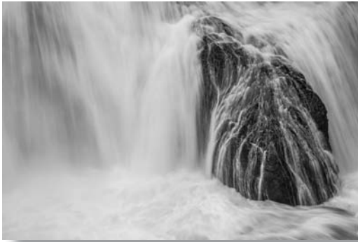
13 - Gibbon Falls, Gibbon River, Yellowstone-2009.jpg Joni Zabala

Really cool shot of the waterfall falling on the rock. Good use of long exposure. I think that upping the contrast might improve the image. Also having something to tie in the left side would help make it stronger.