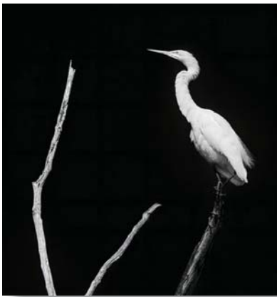
15 - Great Egret.jpg

Nice shot of the egret, very majestic. I would darken down the stick on the left as it stand out a bit much. It shouldn't be brighter than the egret.