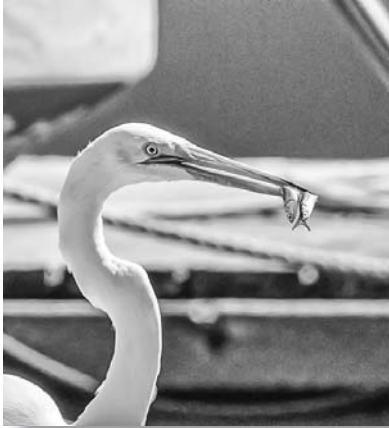
14 - Great Egret (Ardea alba) take-out lunch.jpg Gerald Gifford

Great framing of this shot. How the birds back/neck come in to the frame works well. Good use of depth of field to capture what is important.