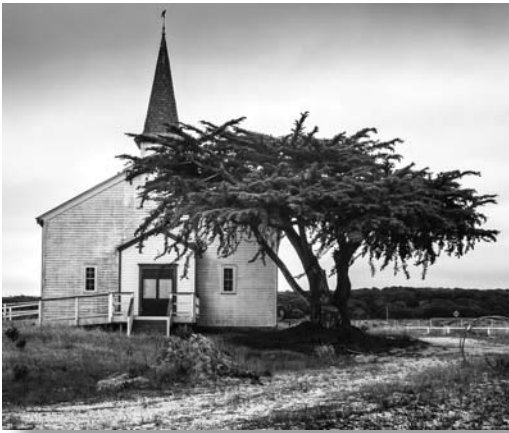
25 - Old Church at Fort Ord.jpg