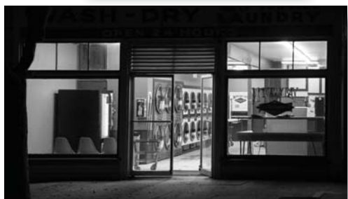
03 - 11 PM at the Laundromat.jpg

I enjoyed the tones and subject matter. I think there needs to be a little more attention to detail on dodging and burning. **