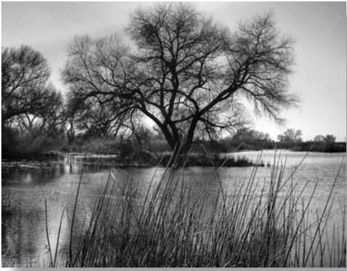
41 - Wildlife wetland, Merced Reserve, CA.jpg