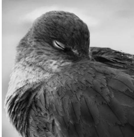
46 - Sleepytime Sanderling.jpg