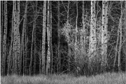
42 - Willow and Aspens, June Lake.jpg