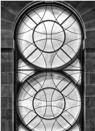
43 - Window in the National Museum of African Art.jpg