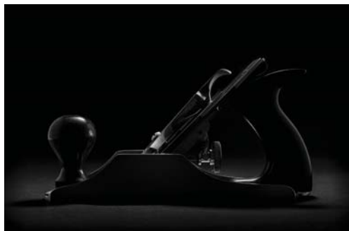
01 - #4 Bench Plane.jpg