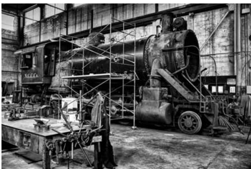
28 - Restoration Workshop.jpg