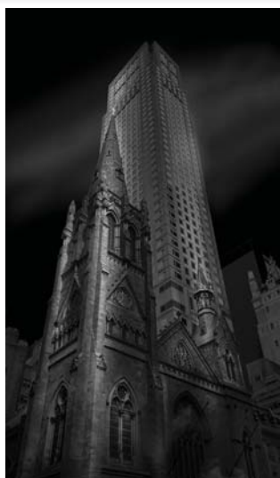
02 - 5th Ave. Presbyterean.jpg

I enjoyed the use of lighting on this image. It shows what it is but there are some parts with no detail which makes the viewer think a bit about it. ****